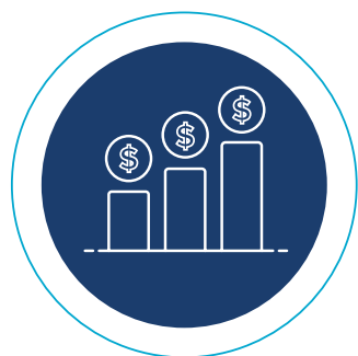
PREMIUM PRICING MODEL