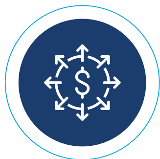
INTEGRATED PRICING MODEL

in large cases or as a standalone treatment, Renuvion allows you to deliver superior outcomes more efficiently. Ultimately, this affords you the opportunity to charge premium rates and offer the best treatment options available. This not only enhances patient satisfaction, but also drives the growth of your practice.