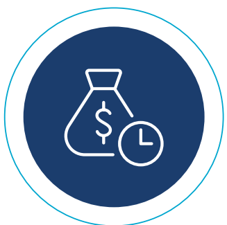
TIME-CENTRIC PRICING MODEL