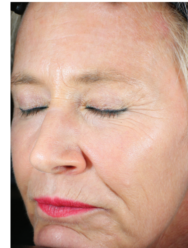
6 Months Post-Op